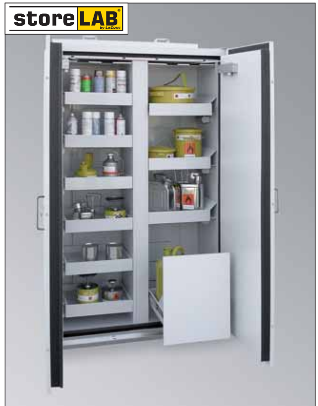
SIS Typ 90 / 1200 ES MI, Article No. B80-2556-B, RAL 7035, incl. 6 pull-out shelves (left), 3 pull-out shelves and 1 disposal compartment (right)