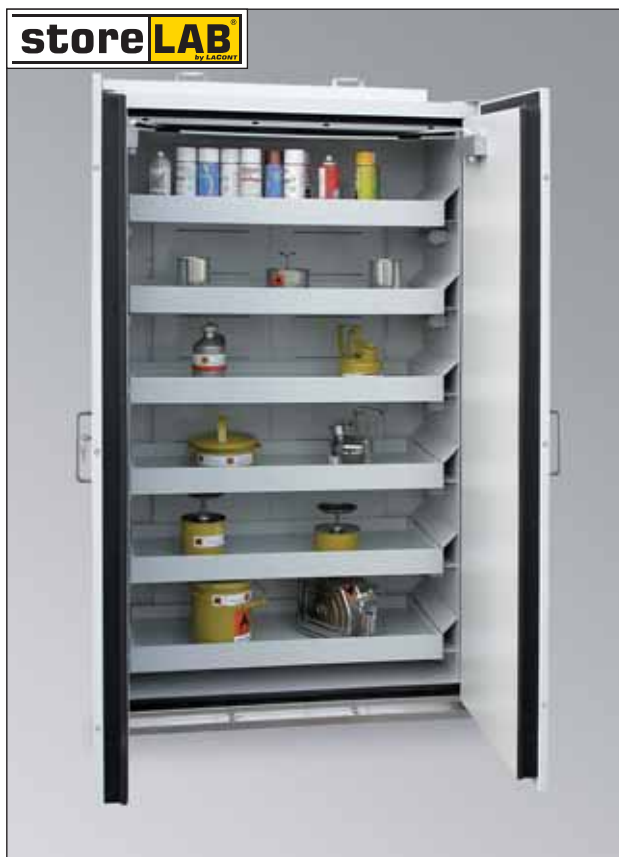
Sis Type 90 / 1200 VS6, Article No. B80-2534-B, RAL 7035, inkl. 6 pull-out shelves